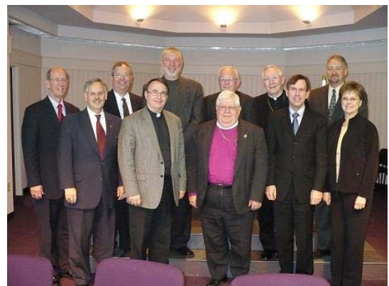
Judicatory Executive Leaders and Bishops

The Ohio Interfaith Power and Light (OhILP) engages citizens concerned about environmental stewardship. Ohio Fair Schools Campaign and the annual Bread for the World workshop provides resources and seeks commitment. Prepare the Future is another cooperative endeavor across the state.